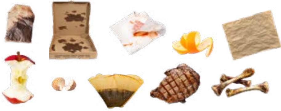
Food Scraps and Food Soiled Paper Desechos de Comida y Papel Manchado con Comida

Material must be clean and dry Material debe estar limpio y seco