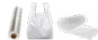
Stretchy Film Plastic Plástico de Película Estirable

Do not put these items in your gray cart: