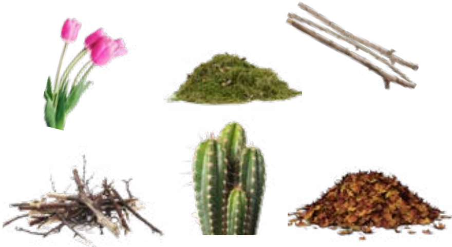
Yard Trimmings Recortes de Jardín

Note: If you do not have a green cart, place all yard trimming material in your gray cart.