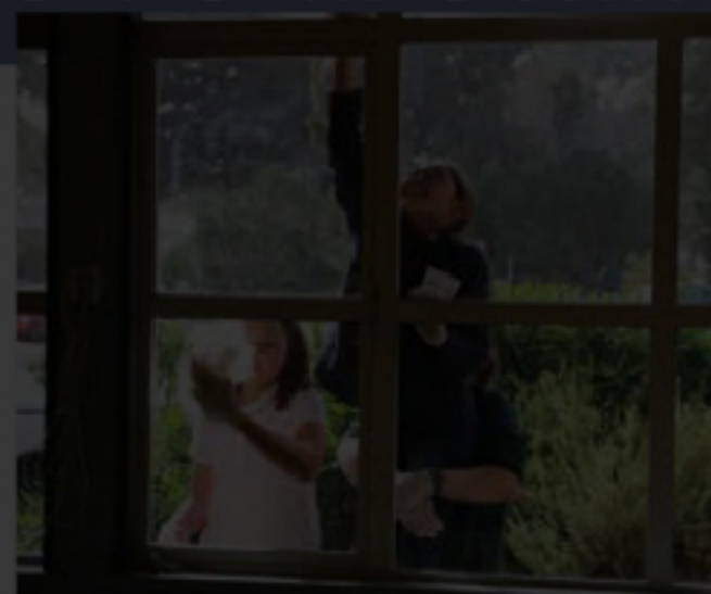
Day of Service - Page 10